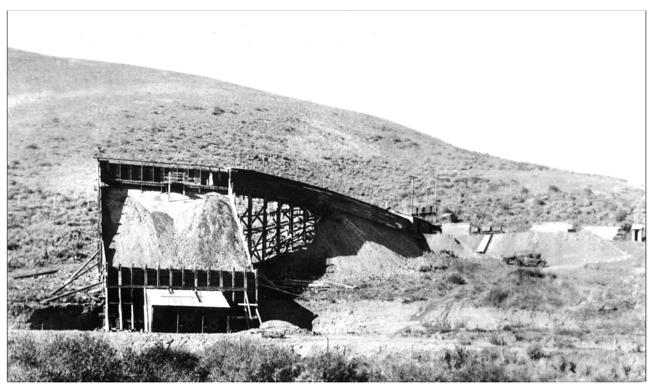
Figure 40. Bear Lake Mine, Western Phosphate Company, 1925.

The mine remained closed during the rest of 1921 and most of 1922 and 1923 with only short events of maintenance and repair. At this time, the underground workings consisted of 1,200 feet of double track tunnel, and raises, crosscuts and drifts totaling approximately 1,500 feet (Kirkham, 1925). Service (1967) stated that there was no reported production after 1922, however, there was a small stockpile of ore outside the mine that provided material for sporadic shipments (Figure 40). In November, 1923, there was a report in the Paris Post that an offer to purchase the mine was made by a Pacific Coast fertilizer company but apparently nothing came of it. On November 30, 1925, the Bear Lake Phosphate Company forfeited their right to do business in Idaho.