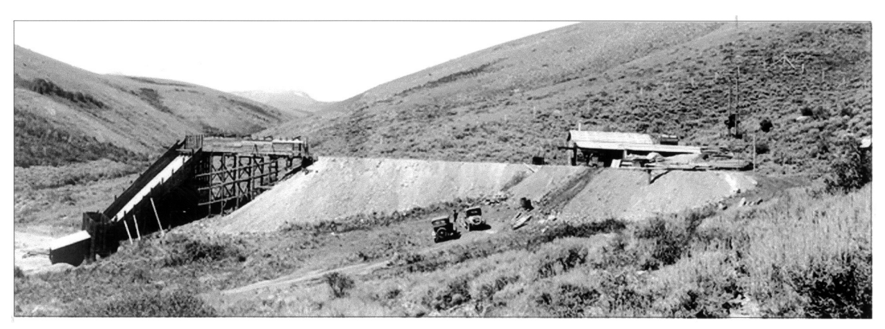
Figure 39. Bear Lake Mine, August 30, 1920.