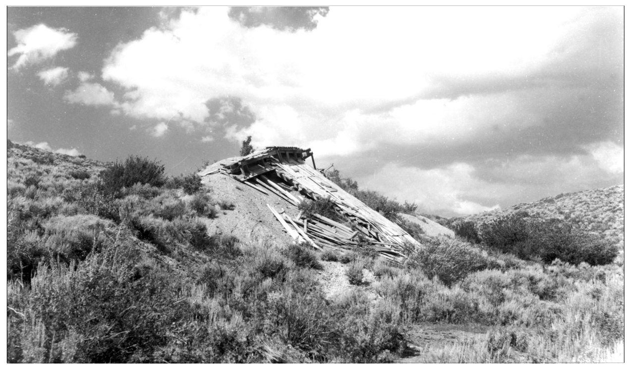
Figure 41. Bear Lake Mine, July, 1966.