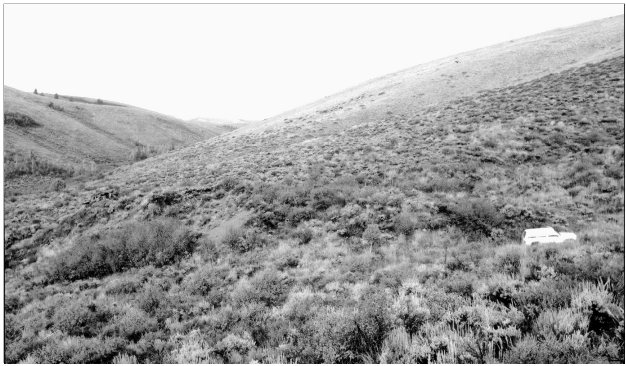
Figure 42. Site of Bear Lake Mine, September 9, 1996.